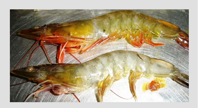
ABOVE: Whiteleg shrimp Penaeus vannamei healthy (upper) and infected with Taura syndrome virus (lower)

Although SPF stock lines are categorised free from specifically listed pathogens (e.g., those of importance in international legislation), the same lines cannot be considered as either 'pathogen free' or indeed, any more able to resist infection and disease associated with emergent diseases. In fact, examples of devastating new diseases continue to occur in otherwise SPF stocks, arising from relatively limited germ-lines, which have been farmed