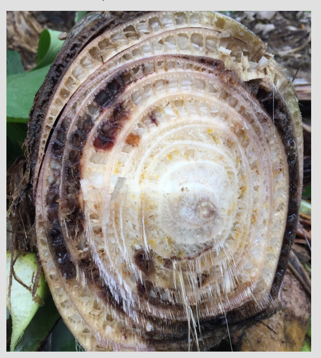
Figure 3. Panama disease affects bananas and is caused by the soil borne fungus Fusarium paoxysporum f.sp. cubense

In order to manage the globally developing epidemic, both short and long-term actions need to be taken. In the short term, current exclusion/control methods have to be scrutinized, as the spread of TR4, also within plantations, overwhelmingly demonstrates their inaccuracy and low efficacy. Reliable and standardized tools and protocols for the detection and management of Foc are urgently required, eq the use of fungicides and biological crop protection agents/methods. Long(er) term solutions, however, should include scrutinizing recommended alternatives for the 'Cavendish' clones and, foremost, highly technologically driven and commercially oriented professional breeding programs should eventually diversify the current market with a variety of new banana cultivars that meet consumer preferences and break-up the conservatism of monoculture. Technology, however, has to engage with society and the environment in multidisciplinary approaches for a sustainable future of the banana and its producers.