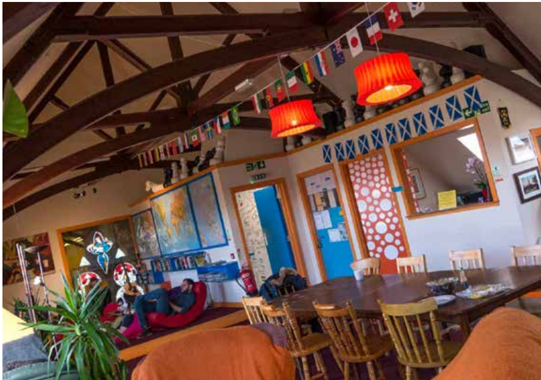
Upper floor lounge and kitchen