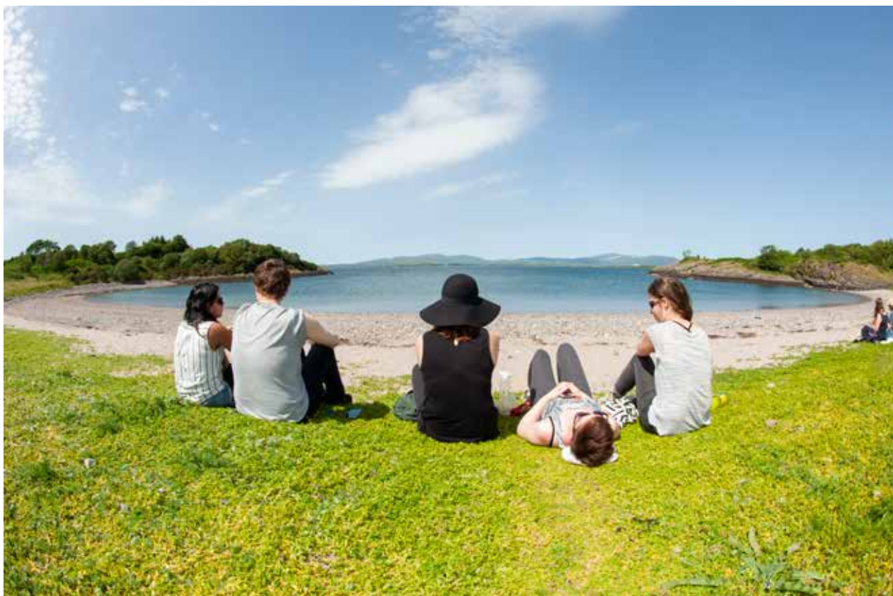
the university on the beach.