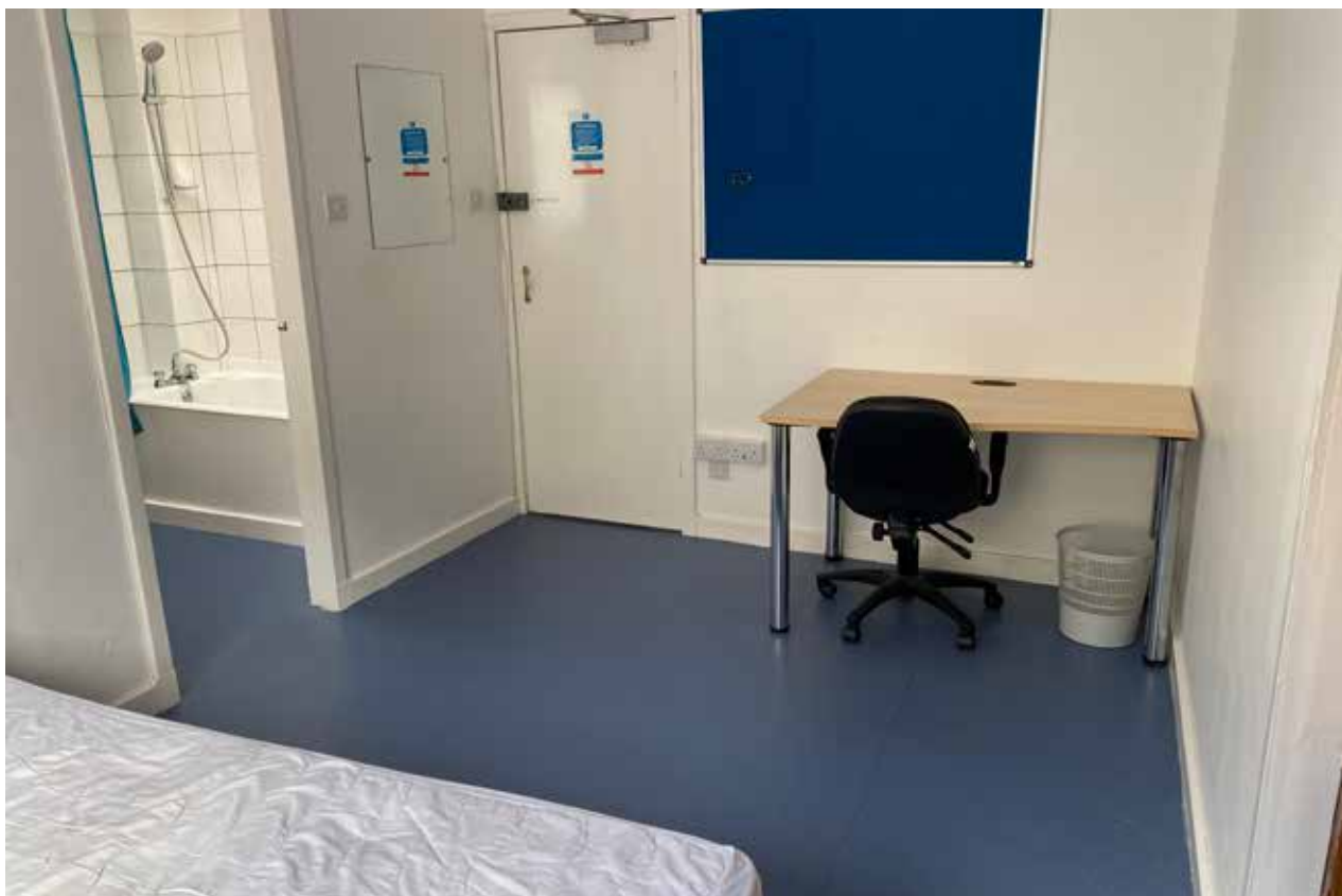
IMAGES: The Margaret Barnes Building entrance. Typical student bedrooms/bathrooms in the MBB.