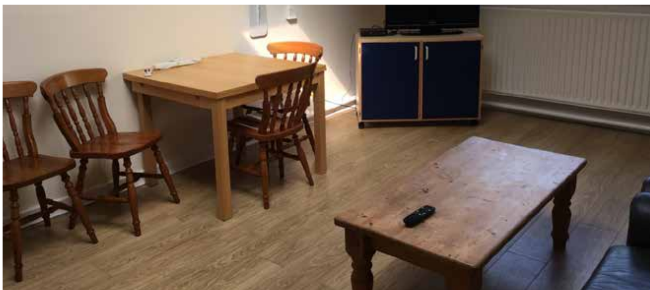
IMAGES: The Margaret Barnes Building: communal areas - kitchen, laundry, lounge/diner.