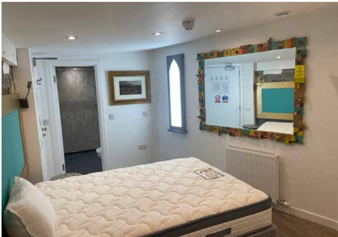
Annex room with ensuite