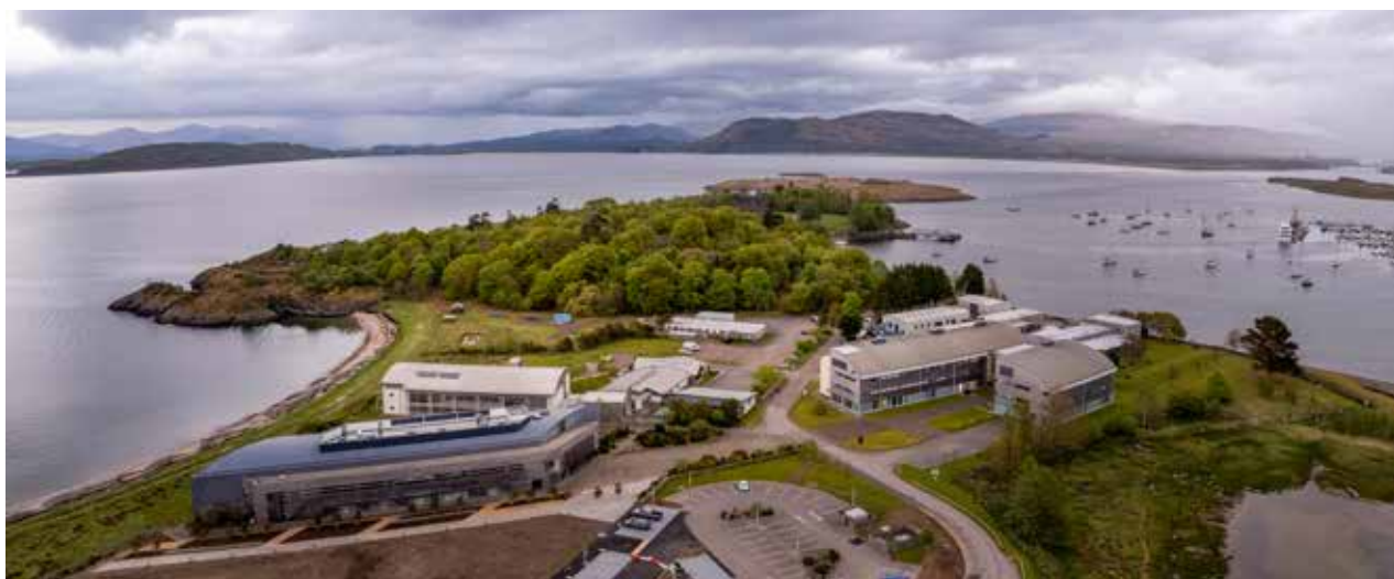
IMAGES: Students enjoy lunchtime swims at the beach. Local woodland walks next to campus. Our campus.